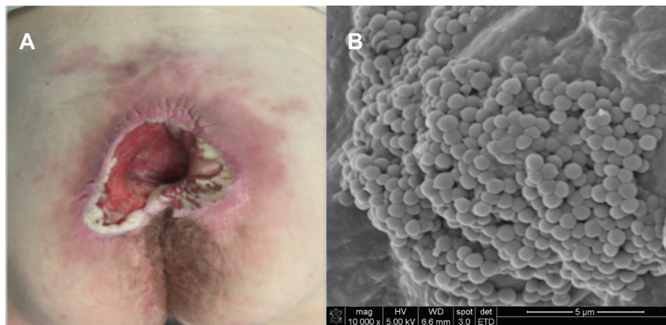
Figure 1. Predebridement biofilm detection in a stage 4 sacral pressure ulcer with history of MRSA osteomyelitis. (A) Sacral pressure ulcer prior to surgical debridement and flap coverage. (B) Scanning electron microscopy image of tissue biopsy taken before surgical debridement (10,000x magnification). Mushroom like projections of cocci emanate from the biofilm-coated surface of the wound.

Bone culture results from our case series demonstrated a mixture of pathogens, with the most common species being Staphylococcus , Streptococcus , Pseudomonas , Acinetobacter and Escherichia , all of which were sensitive to vancomycin and/or tobramycin. We did not observe development of antibiotic resistance with the use of antibiotic beads: of the two patients who received antibiotic beads and had an ulcer recurrence, one grew Pseudomonas aeruginosa , which was sensitive to tobramycin, and the second grew Pseudomonas aeruginosa and MRSA, sensitive to tobramycin and vancomycin, respectively. We encountered two postoperative seromas among the patients who received antibiotic beads, despite placement of a closed-suction drain under the flap. Both seromas resolved after percutaneous drainage. Random levels of vancomycin and tobramycin were obtained on postoperative day 1 for all patients with beads. Elevated serum levels were not observed.