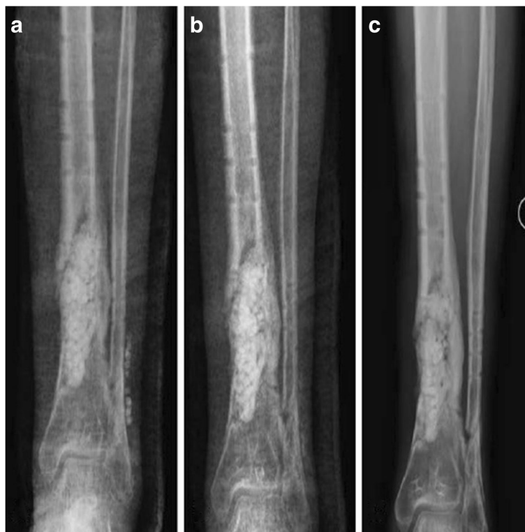
Fig. 3 a-c Postoperative radiographs showed that the combination of calcium sulfate pellets and PMMA spacer was filled in the bone cavity after surgical treatment, and the calcium sulfate pellets were absorbed at an average of 6 weeks (range, 30–60 days)

calcium sulfate pellets and PMMA spacers, debridement of infected tissue, and elimination of dead space with combination with calcium sulfate pellets and vancomycin-loaded PMMA spacers again. One patients required amputation due to recurrent infection in this group.