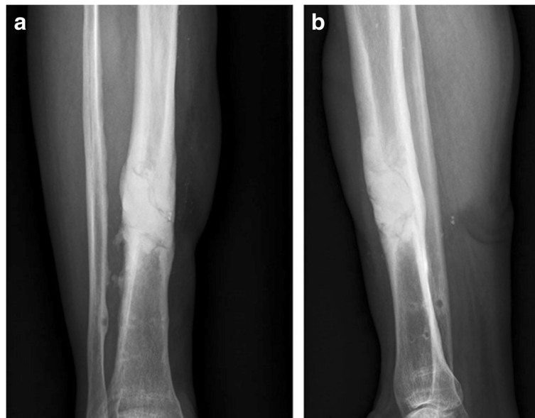
Fig. 2 Postoperative radiographs showed that PMMA spacer was absorbed filled in the bone cavity after surgical treatment. (a) posteroanterior, (b) lateral

sulfate pellets were implanted with monolayer morphology in the bony space after removal of the internal fixation material and thorough surgical debridement. The vancomycin-loaded PMMA spacers before hardening were subsequently filled in the cavity. At last, the vancomycin-loaded calcium sulfate pellets were implanted in the other side of the PMMA spacers's surface without calcium sulfate pellets