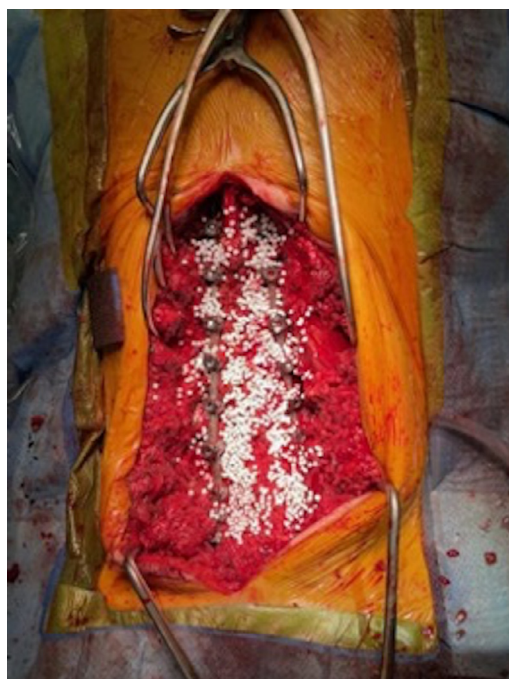
Fig. 1. Continued

spine, and 20cc used in cases where the UIV was in the upper thoracic spine.