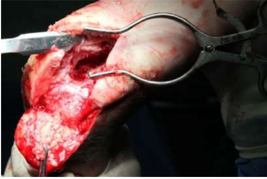
Figure 3. The patient's calcaneus was debrided until the cortical inner lining was reached during eggshell-like debridement.