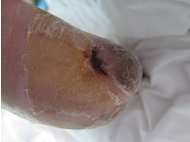
Figure 1. Clinical photograph of the patient upon presentation with a sinus tract.