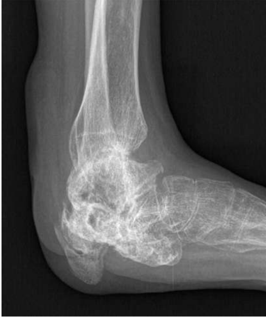
Figure 8. Compared with the Figure 4 , the radiograph of the patient's left foot after the treatment showed the "new-forming" left calcaneus of the patient and the plantigrade foot were achieved.

with chronic osteomyelitis, especially in those who have undergone successive failures in conventional debridement.