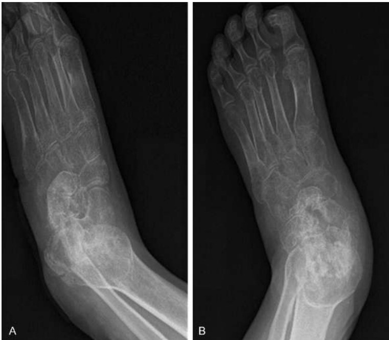
Figure 2. Lateral (A) and oblique (B) radiograph of his left foot before debridement. In addition to foot deformity of equinovarus and pronation, tibiotalocalcaneal arthrodesis was also observed.

right femoral fracture. His calcaneal fracture at left foot was treated with open fracture and internal fixation after debridement. A few days later, his brain injury was cured and femoral fracture was in stable condition. However, the patient began to present with fever, fatigue and