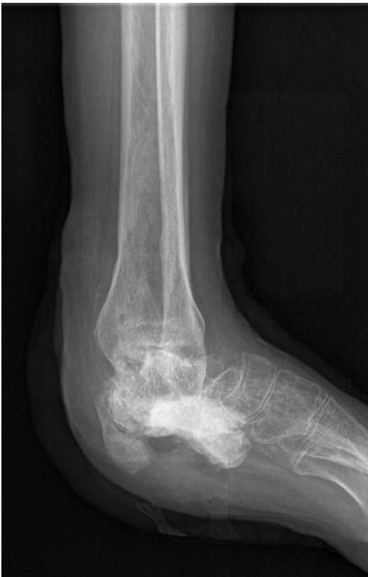
Figure 4. The lateral radiograph demonstrated the Stimulan® was embedded and deformity still existed after eggshell-like debridement.

reached, and debridement continued until raw bleeding was noted. Therefore a hollow calcaneus with almost only cortical bone left was made, which resembled an eggshell ( Figure 3 ). After irrigation the osseous defect was then filled with vancomycin/gentamycin-impregnated calcium-sulfate (Stimulan®, Biocomposite