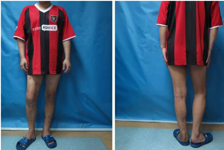
Figure 6. The photograph of the patient approximately 2 years after the whole treatment demonstrated that the left foot of the patients had satisfactory weight-bearing function.